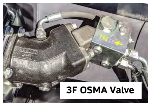
3F OSMA Valve

Technical data are dependent on equipment and may vary. The images may contain additional options which do not belong to the standard scope of delivery. OSMA and FERNTREE Equipment reserves the right to make amendments and updates at any time without prior notice.