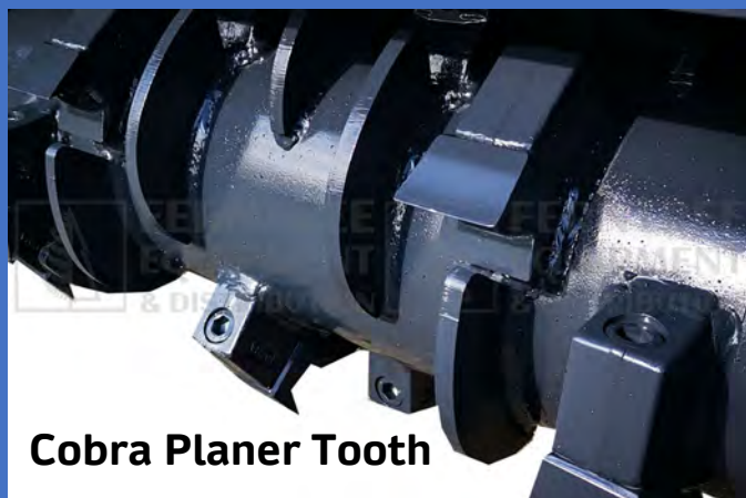
Cobra Planer Tooth