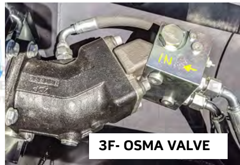
3F- OSMA VALVE

1.By-pass 2.Anti shock 3. Automatic Oil flow regulation