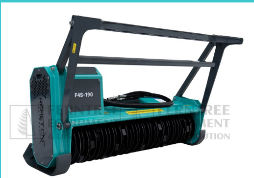
Skid Steer Mulcher 62" – 74" 24Gpm – 58Gpm