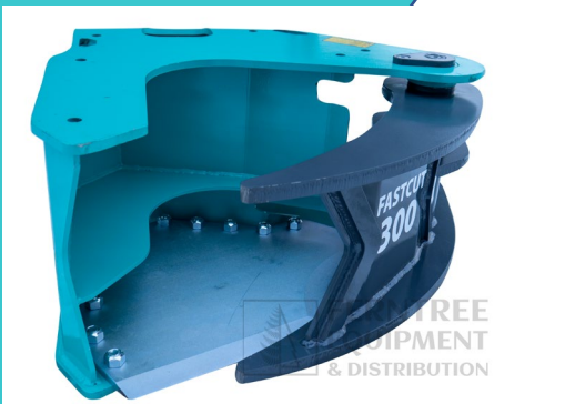
Tree Shears with or without Collector