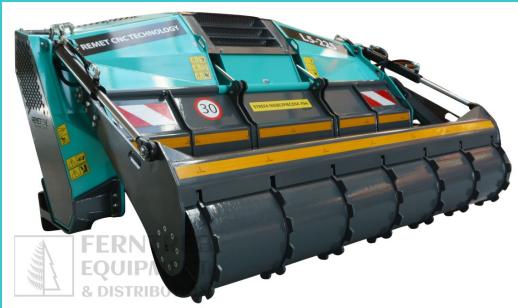
Subsoiler / Forestry Tiller PTO Driven 170 – 400 hp