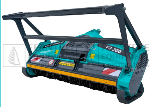
Tractor PTO Forestry Mulcher 70 – 400 hp