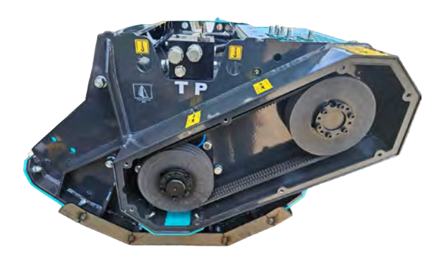
Belt drive Transmission with Generic sized Belts (3) and Generic sized Rotor Bearings Made in Germany.