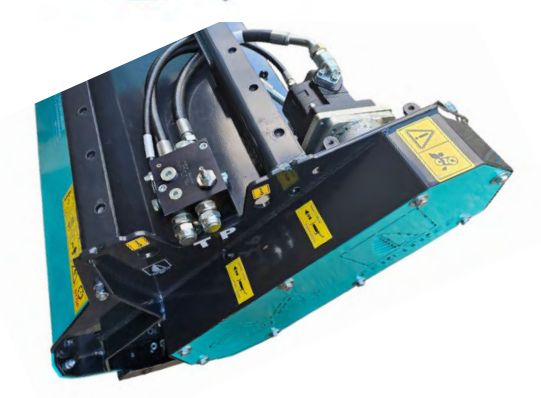
Flow Management combined with CASAPPA Gr.3 Gear Motor without the need of a Case Drain